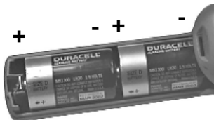
Figure 1. Properly Installed Alkaline Batteries

NOTE: Dispose of depleted alkaline batteries according to applicable state and local regulations. In the absence of such regulations, recycle and/or dispose of batteries through voluntary waste recycling programs.