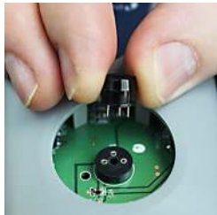
Figure 2. Installing the Sensor