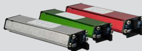
From left to right: refrigerant sensor 724-701-G1, CO 2 sensor 724-701-G2, and flammable refrigerant sensor 724-701-G3.